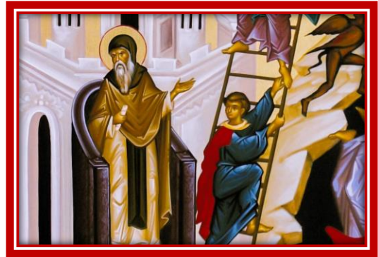
Saint John Climacus

QUALITY: Also, in our traditional eastern tradition, the days of fast are in practice more or less vegan, that is, no meat, no seafood, no meat products, no dairy products, and no eggs are eaten.