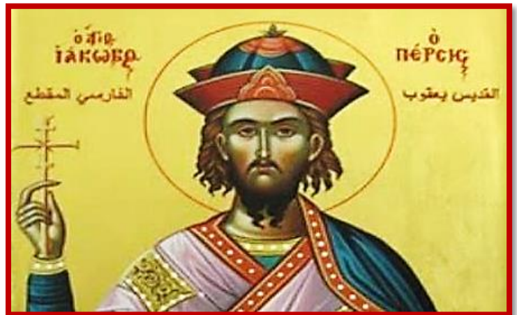
Saint James Intercisus, Martyr

Buy a raffle ticket today. What would djidoo say?