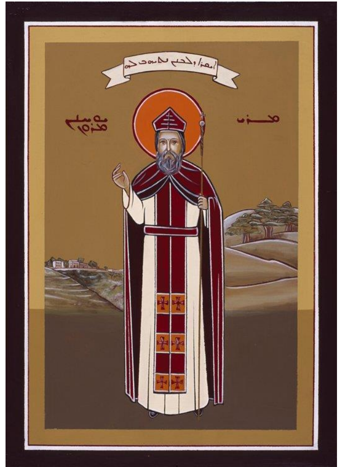
Our First Patriarch, Saint John Maron, Confessor