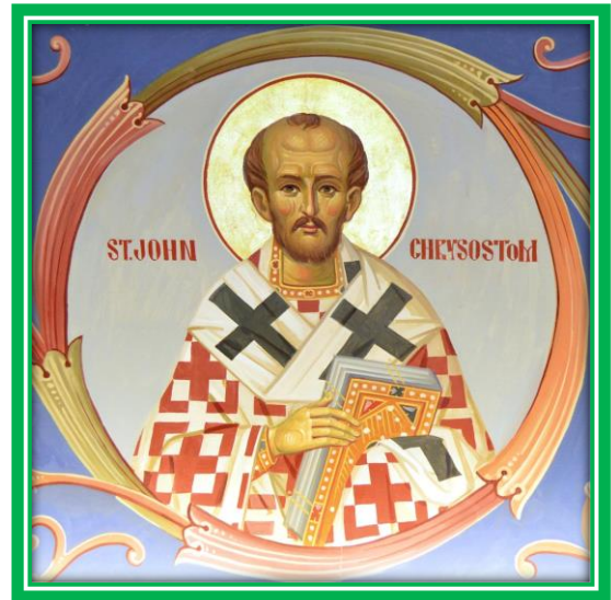
Saint John of Antioch "Chrysostomos" Patriarch of Constantinople Confessor