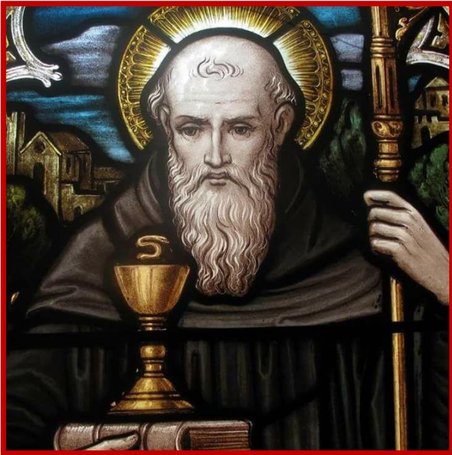
Saint Benedict, Abbot July 11 th