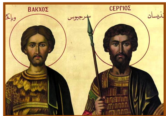
Saints Sarkis and Bachus, Martyrs October 7 th

Let's show true devotion to our Lebanese heritage and game heartily! Buy a raffle ticket. What would djidoo say?