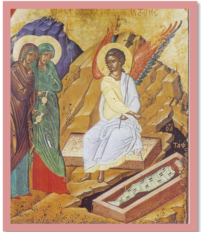
Herald of the New Creation