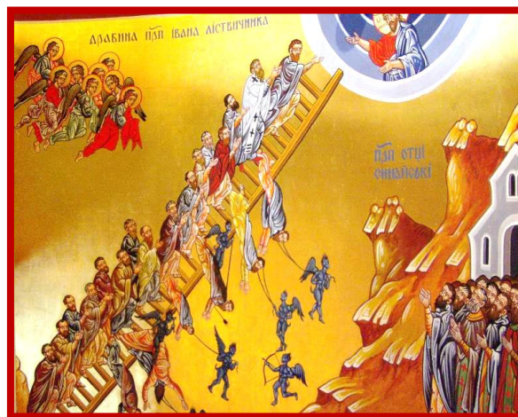
The Ladder of Divine Ascent

Blessed be the Merciful One Who gives us the ability to sustain this apostolate.