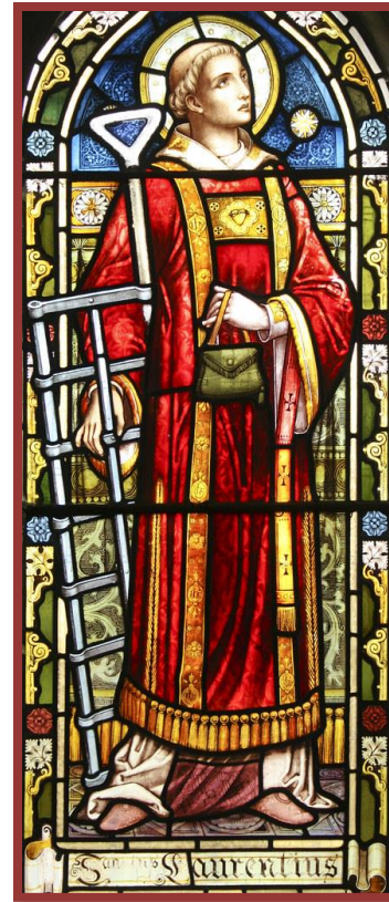
Saint Lawrence, Martyr August 10 th

These observances are for all who have attained the age of the use of reason, par. 22.