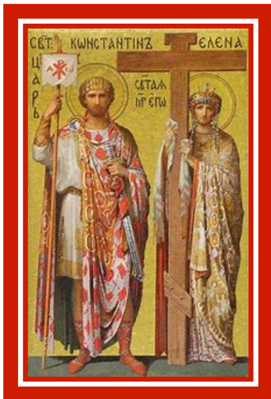
Saint Constantine the Great and Saint Helen, Equal-to-the-Apostles Feastday, May 21 st