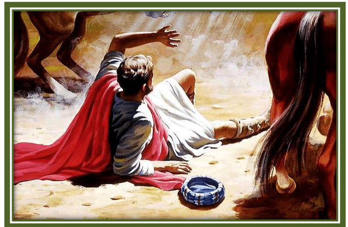
Conversion of Saint Paul January 25 th