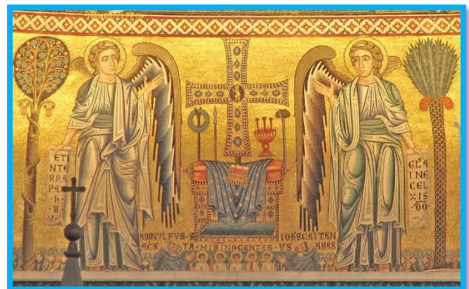
Exaltation of the Holy Cross

Lighting of the Church: LB* p 5 Jesus Christ, O Source of Light