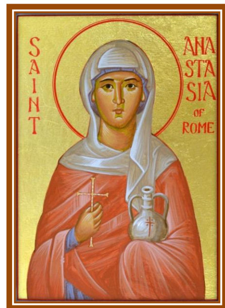
Saint Anastasia of Rome