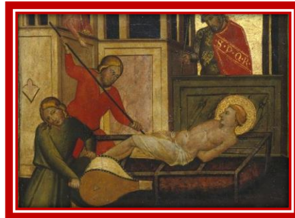
Saint Lawrence Martyr August 10 th

These observances are for all who have attained the age of the use of reason, par. 22.