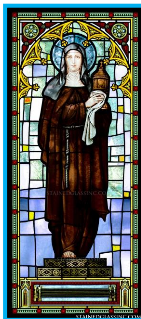
Saint Clare of Assisi hermitess and foundress