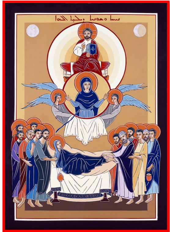
The Glorious Assumption of the Mother of God August 15 th

Cost of each ticket is $100.00, with the winning ticket for the prize to be drawn Tuesday, December 3rd.