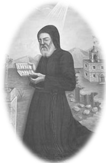
Saint Awteel, Confessor June 3 rd