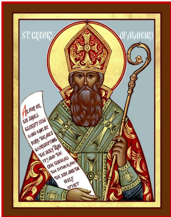
Saint Gregory the Illuminator, Apostle of Armenia September 30 th